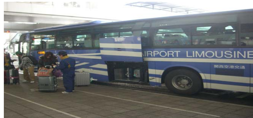
Figure 4. Airport Limousine Bus