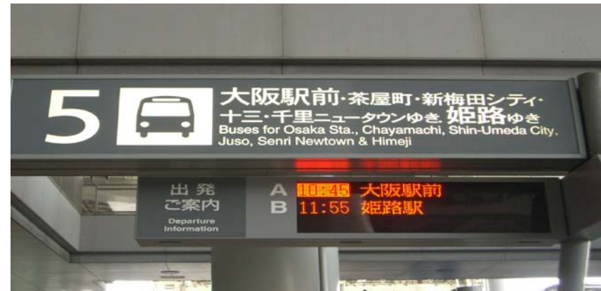
Figure 2. Bus Stop #5 for Airport Limousine Bus to Osaka Station