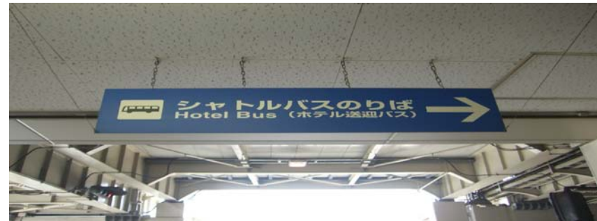
Figure 7. Hotel Shuttle Bus Stop Direction Sign