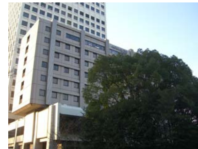
Figure 12. Hotel NCB