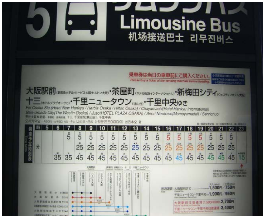
Figure 3. Limousine Bus Schedule from Kansai Airport