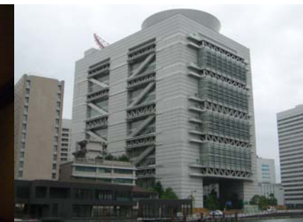
Figure 11. GCO