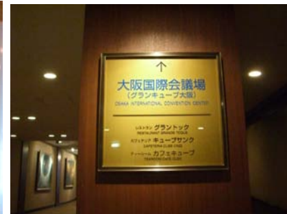
Figure 10. Hotel Lobby to GCO