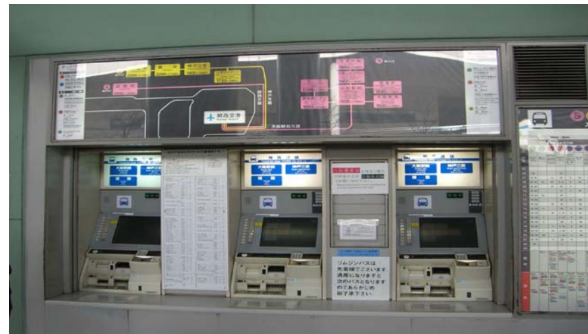
Figure 5. Bus ticket machine