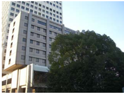
Figure 11. Hotel NCB