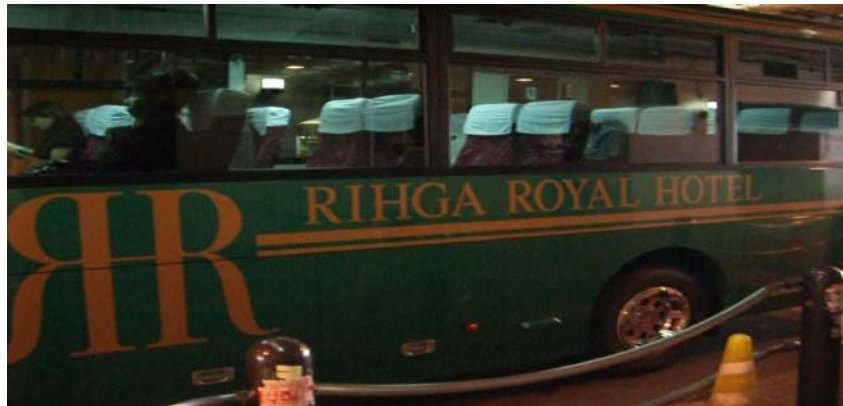
Figure 13. Rihga Royal Hotel Shuttle Bus

16. It takes about 10 minutes to Rihga Royal Hotel from Osaka Station. After arrival at Rihga Royal Hotel, if you have a reservation at Rihga Royal Hotel, you can simply walk into the lobby, go to the checkin desk and checkin. If your destination is NOMS 2010 Symposium