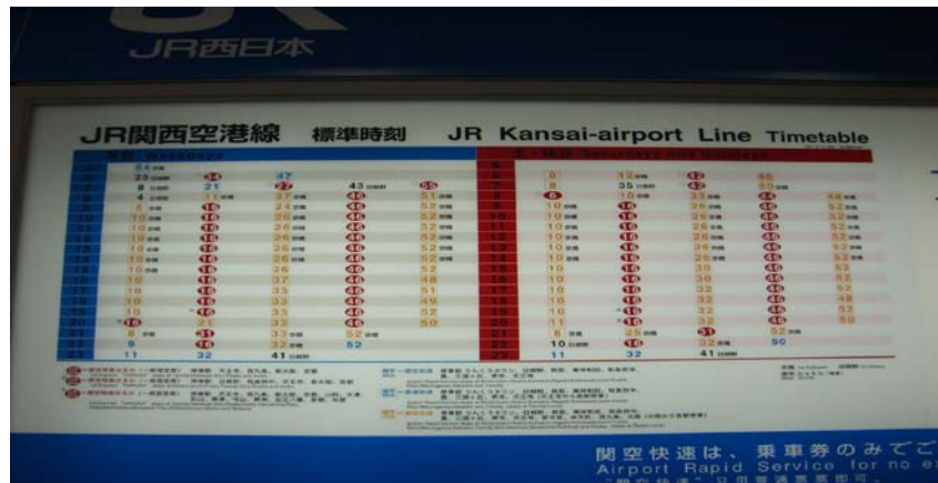
Figure 4. JR Kansai-Airport Line Timetable