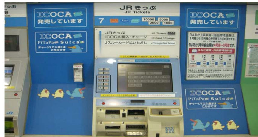
Figure 5. JR Train Ticket Machine