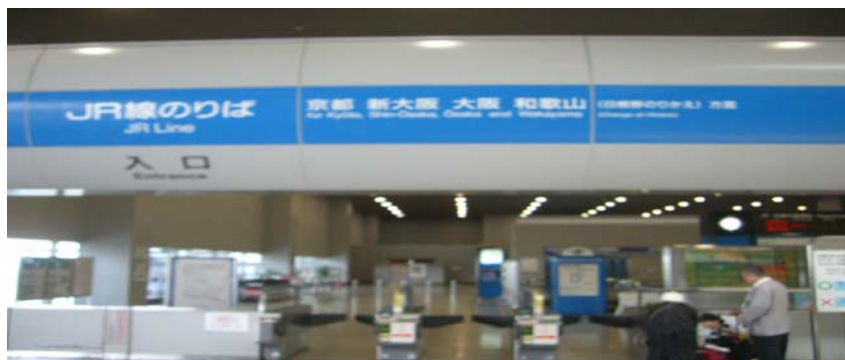
Figure 7. JR Kansai Airport Rapid Service Entrance