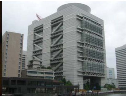
Figure 16. GCO