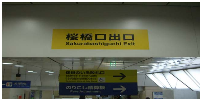
Figure 10. Sakurabashi Exit

12. You can exit Osaka Station by putting your ticket through the gate machine. If you need to get a receipt of your train ticket, you can go to the Staffed Ticket Gate located on the right side of the gates. If you ask a staff for a receipt, he will make a hole and put a stamp on your ticket and return it to you.