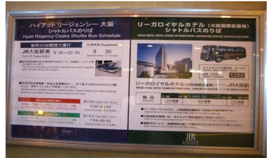
Figure 14. Rihga Royal Hotel Shuttle Bus stop 및 정보 (오른쪽)

Venue (GCO), then go through the Rihga Royal Hotel lobby and get to GCO which is right next door to the hotel (see Figure 15 & 16).