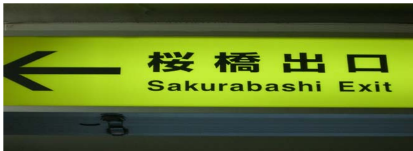
Figure 9. Follow the Sakurabashi Exit sign