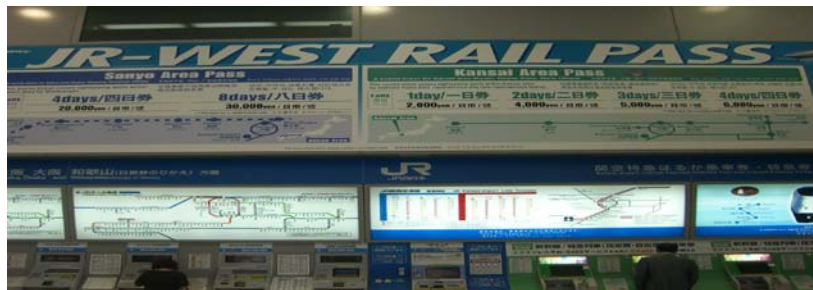
Figure 3. JR-WEST RAIL PASS (KANSAI Area Pass)