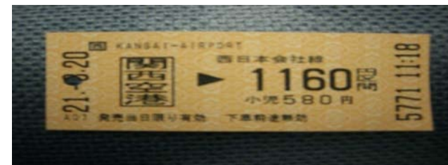
Figure 6. Train Ticket showing the fee of 1,160 Yen