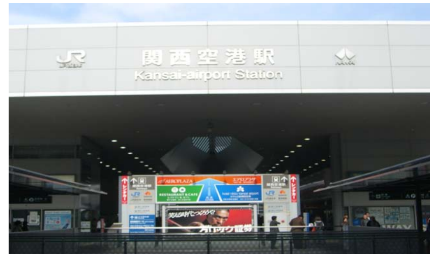
Figure 2. Kansai Airport Station