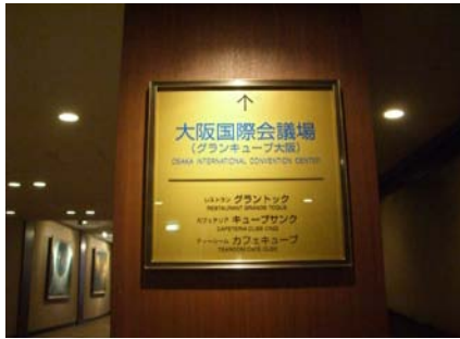
Figure 15. Hotel Lobby to GCO