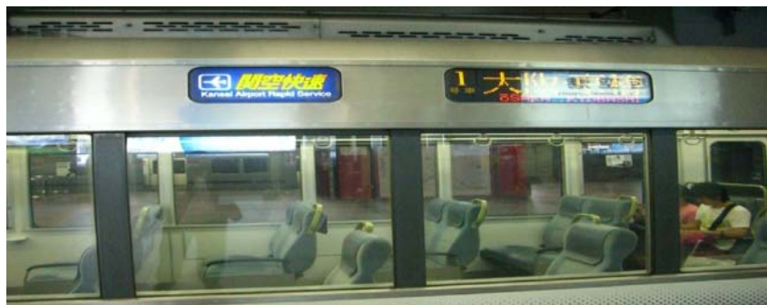
Figure 8. JR Kansai Airport Rapid Service train to Osaka Station